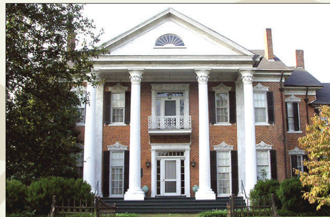
MONTROSE—1858 335 Salem Avenue