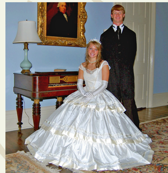
2012 PILGRIMAGE ROYALTY