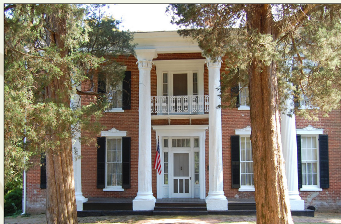
WAKEFIELD - 1858 495 Salem Avenue