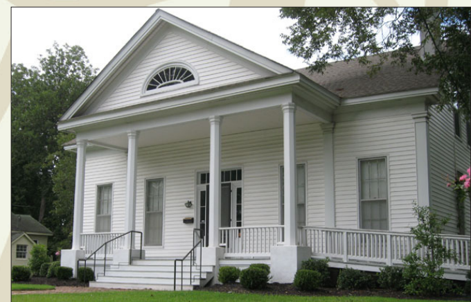
IDA B. WELLS-BARNETT MUSEUM—1858 220 North Randolph Street