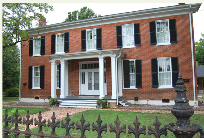
BURTON PLACE –1848 248 South Memphis Street