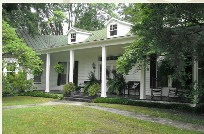
CUFFAWA—1832 310 West Chulahoma Avenue